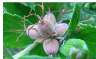
Adriana quadripartita Rare Bitterbrush