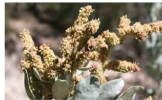
Atriplex cinerea Grey Saltbush