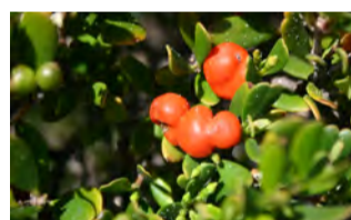
Alyxia buxifolia Sea Box