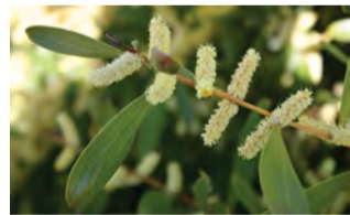
Acacia longifolia ssp. Sopherae Coastal Wattle