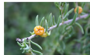
Enchylaena tomentosa Ruby Saltbush

Uses in Landscape: Attractive small groundcover that is also affective in pots, hanging baskets and small to large gardens. Full sun.