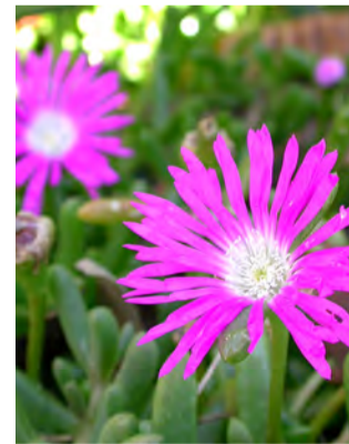
Disphyma crassifolium var. Clavellatum Round-leaf Pigface

Uses in Landscape: Attractive for borders, mass planting, small groups, pots, indoor, small to large gardens. Full sun to shade.