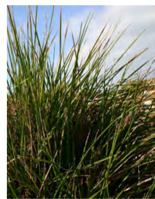
Dianella brevicaulis Short-stem Flax-lily