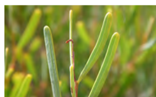
Acacia cupularis Cup Wattle