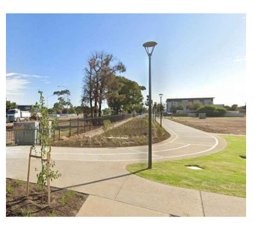
POST-TOP LIGHT FITTING ("CREE EDGE")