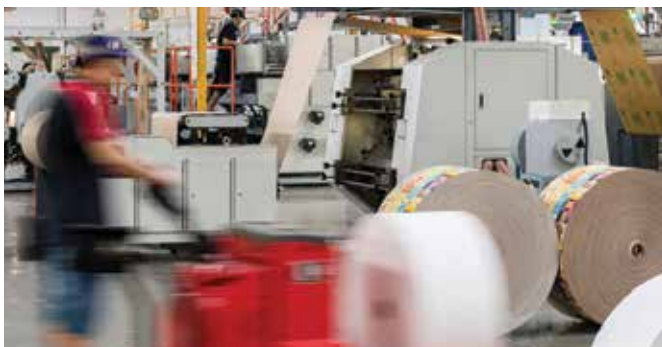
The Hygiene Co