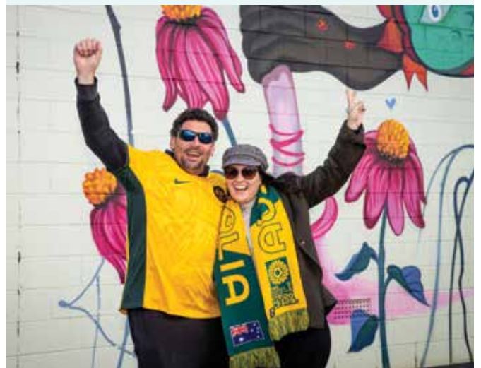
FIFA Women's World Cup Australia and New Zealand 2023

Coopers Stadium underwent a $53 million redevelopment, in preparation for the FIFA Women's World Cup Australia and New Zealand 2023.