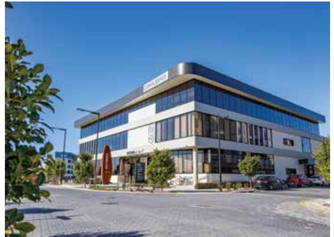
Ngutungka West Lakes and Complexica building

Council has seven major industrial areas, and five district shopping centres including Westfield West Lakes and Armada Arndale.