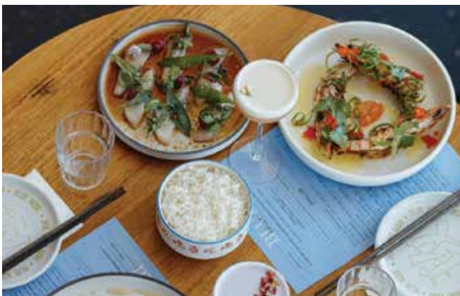
Blue Rose Henley