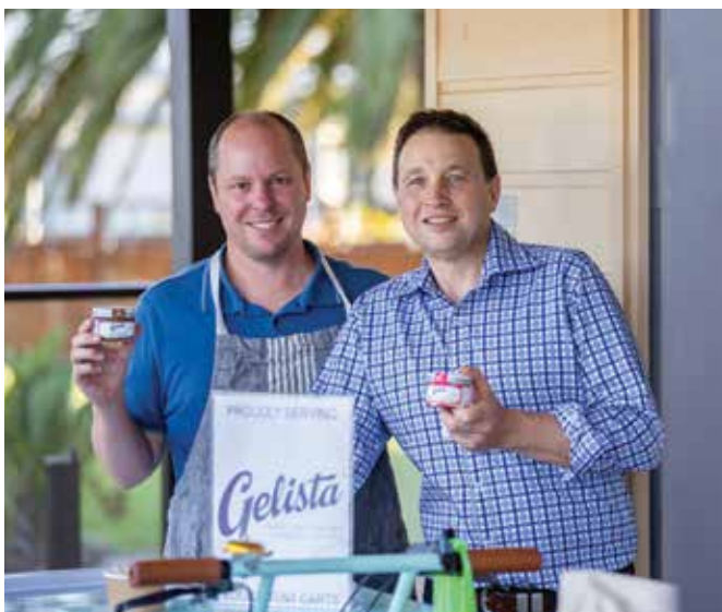
Gelista (and at tourism networking event)