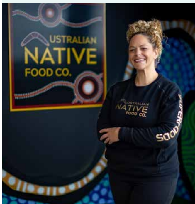
| Australian Native Food Co with grant-funded mural art

The City of Charles Sturt is home to 105 diverse cultures that have made our City a vibrant and dynamic community unlike any other in South Australia. We want to celebrate this rich tapestry of culture within our community.