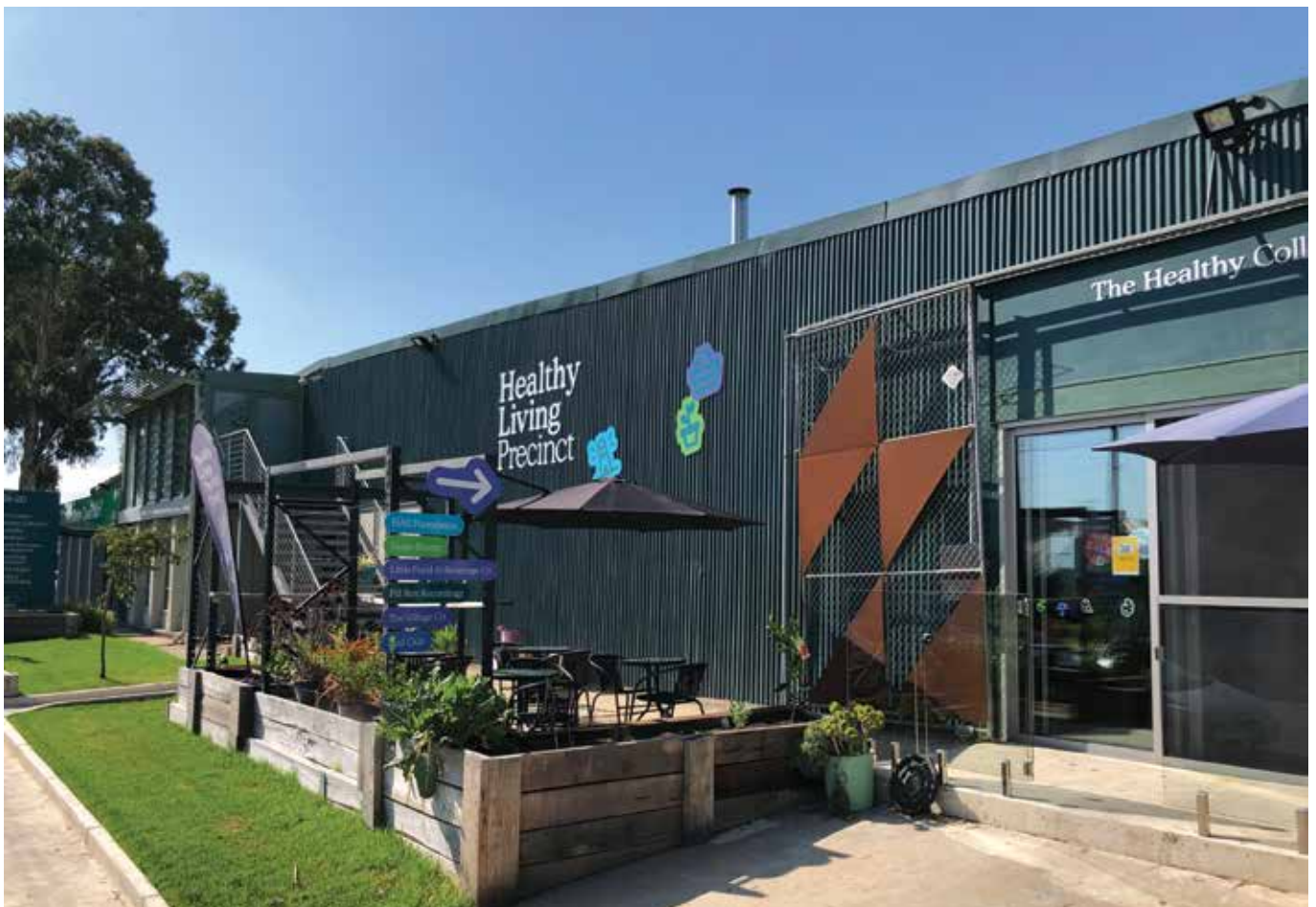
Healthy Living Precinct, Welland

The population of the Western Adelaide Region is estimated to grow by over 42,000 people over the next 18 years. Growth in housing in close proximity to employment and the CBD continues to attract investors and homeowners alike to the City of Charles Sturt. The redevelopment of The Queen Elizabeth Hospital (TQEH) and relocation of rehabilitation services from outside the region, will support this growing population now and into the future.