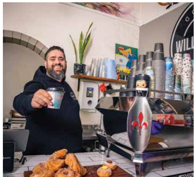
Willow Bend Coffee Roasters, Queen Street

Mainstreets and Placemaking – Our Economic Development and Placemaking teams work closely with traders to improve and activate our mainstreets.