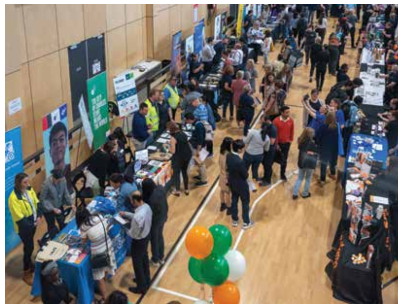
Western Adelaide Jobs Expo 2023 at St Clair Recreation Centre

Council plays an active role in helping businesses find talent, through relationships with local employment agencies and facilitating events to promote local opportunities.