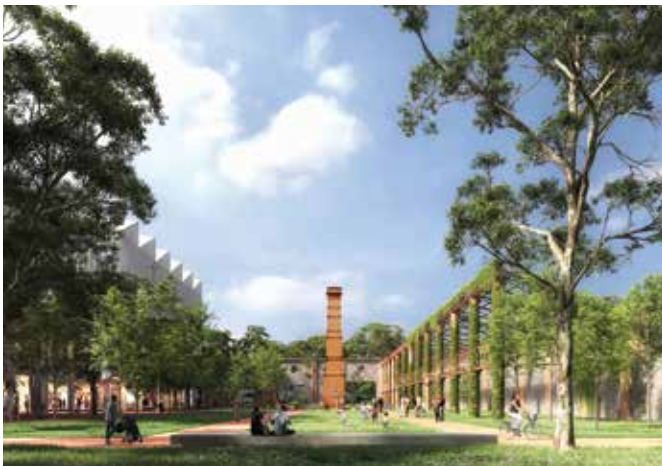
Concept of MAB Development, Bowden