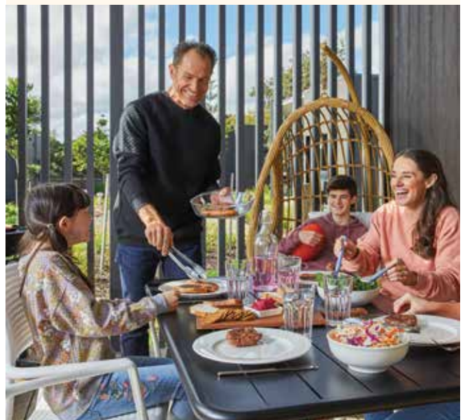
West Beach Parks