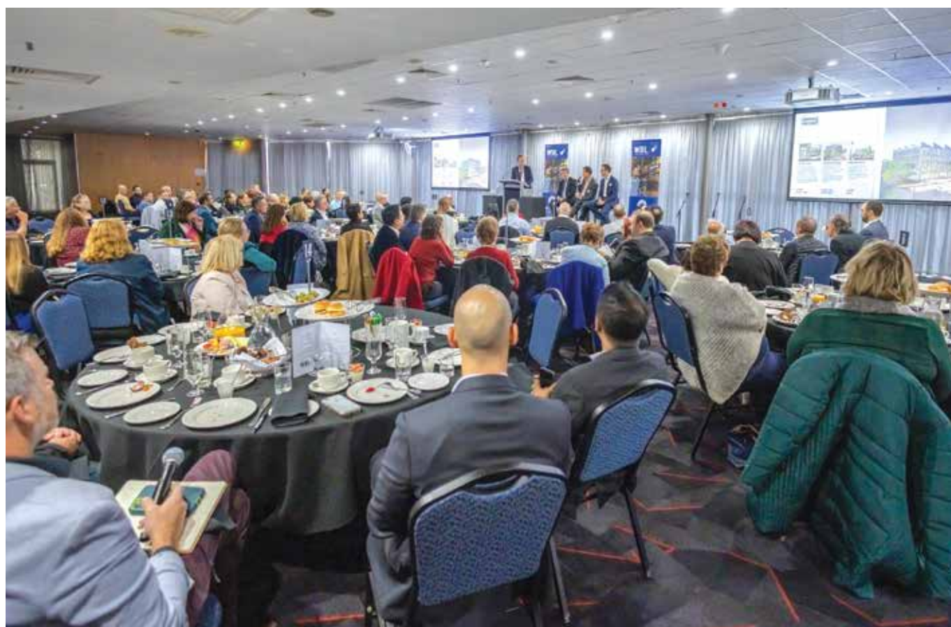
Invest in the West – investment networking business breakfast, Adelaide Entertainment Centre

Such an approach enables businesses to invest and grow with confidence knowing that such support exists and you can be heard. The Economic Development Strategy can be viewed at charlessturt.sa.gov.au