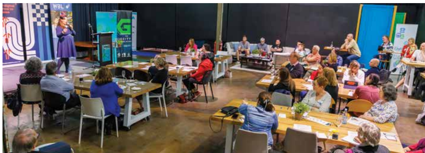
WBL event at Healthy Living Precinct

Various event and workshop series occur throughout the year, including women in the West, tourism industry networking and much more.