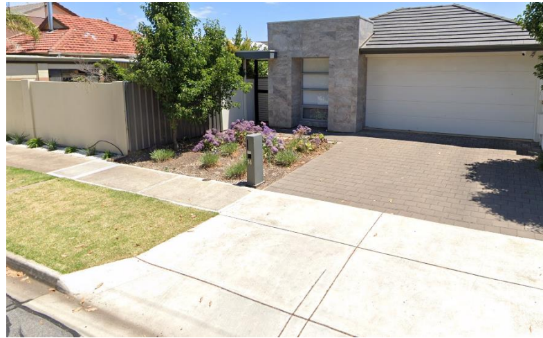
14 Alfrina Street