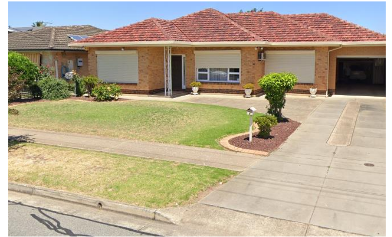
3 Dean Avenue