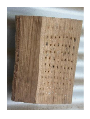
A nesting block hanging in a sheltered spot